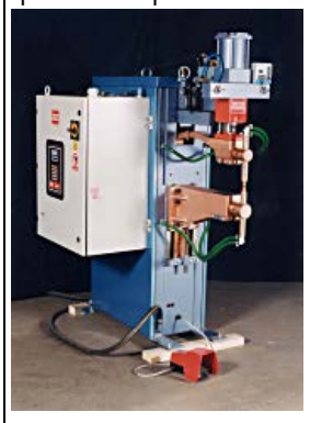
miniature bench welder