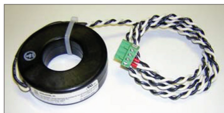
Primary Coil (P5)