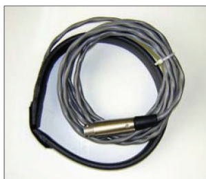
Rogowski Coil (S6)