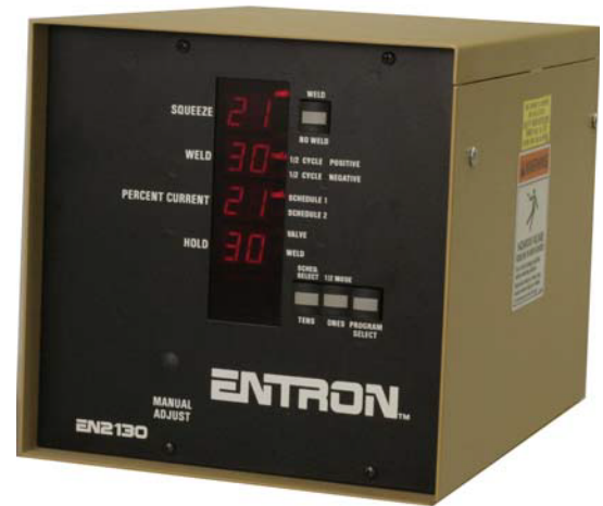
EN2130 Style "B" Cabinet 222mm x 222mm x 296mm 8-3/40x 8-3/40x 11-3/40

The EN2130 Series Control is a microprocessor based resistance welding control. This control is equipped with dual schedule, dual heat, with positive or negative 2 cycle feature. Initiation of two different weld schedules (Squeeze, Weld, Hold, and Percent of Current) are available on separate initiation inputs.